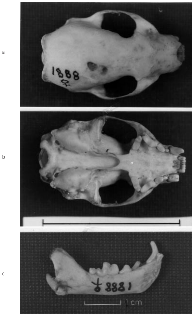
Figure 2. The skull of Vormela peregusna from Cönen, Balıkesir. a) Dorsal, b. Ventral, c. Mandible. Scale: 5 cm.

According to Ognev (4), the nominate subspecies occupies the northern parts of Turkey. In contrast, Lehmann (7) and Harrison and Bates (3) referred to Turkish specimens as Vormela peregusna alpherayki whose type locality is Ashkhabat Turkmenistan. Pocock (10) described V. p. syriacus from Tiberias (Syria).