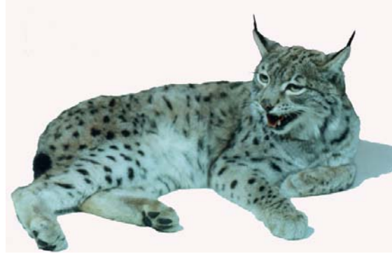
Figure 3. A lynx, Lynx lynx , from Tortum, Erzurum, in Ankara Zoo (photographed by Dr Selçuk Aktürk).

specimen to the subspecies level, owing to a lack of adequate comparative material. Nevertheless, it seems probable that it belongs to L. l. dinniki , because the type locality of dinniki (North Caucasian lynx) is very near to the location of the specimen obtained from northeastern Turkey.