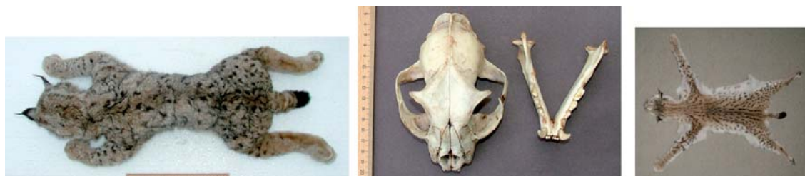
Figure 2. Skin (left) and skull (middle) of the subadult female of lynx from Ardanuç, near Artvin, and skin (right) of the adult specimen of lynx from Isparta, Şarkikaraağaç.

It was not possible to identify the Ardanuç