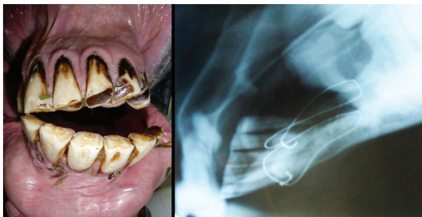
Figure 3. Clinical appearance and radiographical view of the case on the last follow up examination. Fracture healing was determined and rostral malocclusion due to unconscious mastication during the postoperative awakening.

In the postoperative first follow up day, it was observed that some sutures were open or the sutured soft tissue defect was torn and food particles were entrapped in the oral lesion. Because of this, saline lavage was performed 3 times a day within the defects and the food particles were removed. An oral antiseptic was used to prevent possible bone infection. The oral wounds become smaller and then healed within 7 weeks following this application.