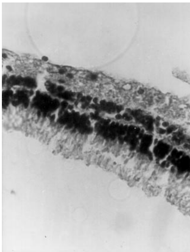
Figure 3. Pyknosis and thin sensorial retina was observed in the control group (H&E X400)

of rat cerebellar granule cells, Pizzi has found that Nifedipine used at 100nm concentration significantly counteracted the neuronal death induced by 15 min. application of 50um glutamate (20). Crosson also has reported that Nifedipine had a potential therapeutic effect on ischemic retinal dysfunction (21). In all these experiments, nifedipine was found to be effective in inhibiting Ca^{+2} influx into the cell. Contrary to these report, Koh and Cotman have reported that in their in vitro experiment a decrease in intraneuronal calcium levels may trigger synthesis of proteins mediating cell death (22). Some other in vitro experiments have