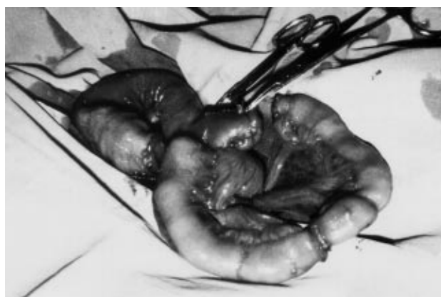
Figure 1. (a) Segments of colon and ileum used for creation of pouch and its two outlets.

*The measurement was carried out at 1/2 max. pouch vol. by manual compression.