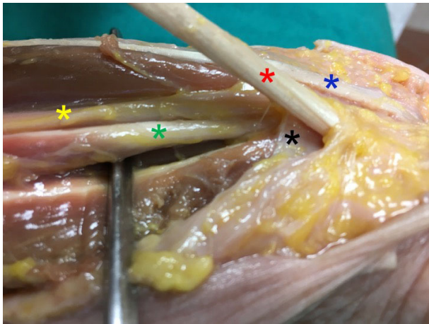
Figure 2. Dissection of the wrist joint. Black asterix; flexor retinaculum. Red asterix; tendon of flexor carpi radialis. Blue asterix; tendon of palmaris longus. Yellow asterix; median nerve. Green asterix; tendon of flexor pollicis longus muscle.

as donor in tendon transfers and reconstructive surgeries of the forearm [22,31]. Due to this proximity, any disorder like tenosynovitis of the FCRT may imitate carpal tunnel syndrome [10]. Therefore, FCR tenosynovitis should be considered in the differential diagnosis of carpal tunnel syndrome and a detailed examination should be performed.