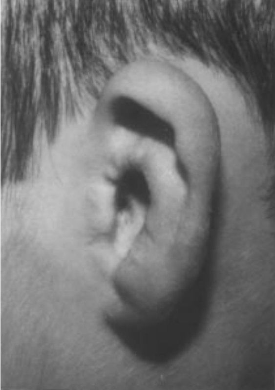
Figure 3. Overall lateral view of the constructed ear 3 years postoperation.

the remnant cartilage in their framework fabrication. All techniques may result in conspicuous long scars in the infraauricular, retroauricular and donor regions. There are many complications attendant upon auricle reconstruction, such as flap necrosis, infections, and