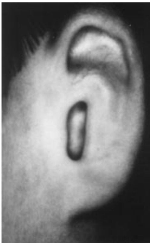
Figure 1. Patient with left atypical microtia.