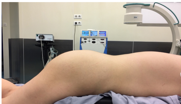
Figure 1. Operation position.

Demographic data of all patients were recorded. A detailed history and urogenital and neurological examinations were performed. Voiding diary, routine laboratory examination, and urodynamic investigation were conducted. Etiology of the voiding dysfunction, symptom duration and follow-up period were noted. Patients were followed every 3 months after the procedure for the 1st year and then yearly. Percentage improvement in symptoms, median test period, voiding diaries, and global response assessment (GRA) scores were determined. Improvement of symptoms of at least 50% or more, discontinuation or significantly decreased use of clean intermittent catheterization, improvement of frequency, urgency and urge incontinence symptoms were considered success of the procedure. Patients were controlled for procedure-related complications and any other side effects.