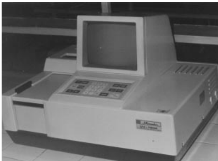
Figure 3. Spectrophotometer instrument.

restorations with a one millimeter peripheral margin of tooth remained exposed (Figure 2).