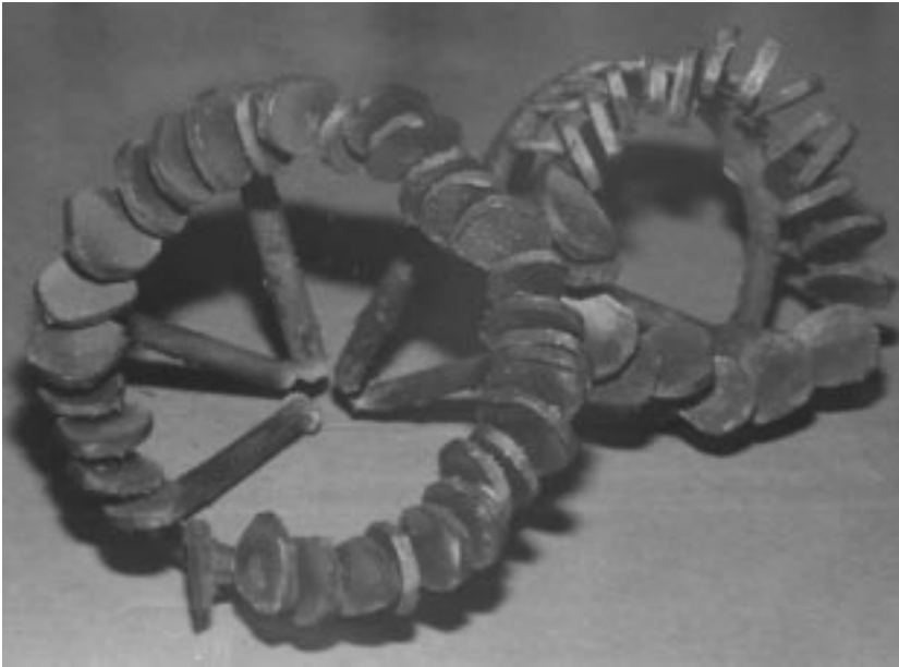
Figure 1. Casted metal discs.