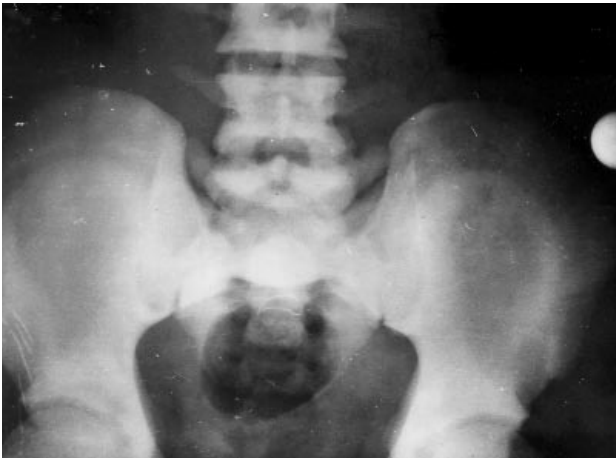
Figure 1. "Bone within bone" appearance in the ileum.

mechanism common to all the known forms of osteopetrosis is a failure of bone resorption.