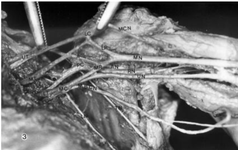
Figure 3. An anastomoses between the anterior division of the middle trunk and the medial root of the median nerve (A); UT, upper trunk; MT, middle trunk; LT, lower trunk; MC, medial cord; PC, posterior cord; LC, lateral cord; AN, axillary nerve; RN, radial nerve; MCN, musculocutaneous nerve; LR, lateral root of the median nerve; MR, medial root of the median nerve; MN, median nerve; UN, ulnar nerve; MBCN, medial cutaneous nerve of the arm; LN, long thoracic nerve; TN, thoracodorsal nerve

nection between the medial radix of the median nerve and the ventral division of the middle trunk (Fig. 3). Two of the plexuses (1.54% on the left side) had a branch which arose from the posterior division of the middle trunk and connected to the medial cord (Fig. 4). The distribution as to sex and side of the body of the observed variations are summarized in table 1. These results suggest that variations in the formation of the brachial plexus are not influenced either by sex or body side.