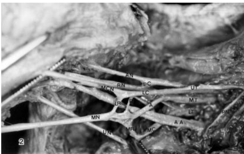
Figure 2. The right brachial plexus of a newborn cadaver showing a variation in the formation of the median nerve. A, the anterior division of the middle trunk contributes to the formation of the median nerve; B, proximal part of the lateral root of the median nerve. AA, axillary artery; UT, upper trunk; MT, middle trunk; LT, lower trunk; MC, medial cord; PC, posterior cord; LC, lateral cord; AN, axillary nerve; RN, radial nerve; MCN, musculocutaneous nerve; LR, lateral root of the median nerve; MR, medial root of the median nerve; MN, median nerve; UN, ulnar nerve