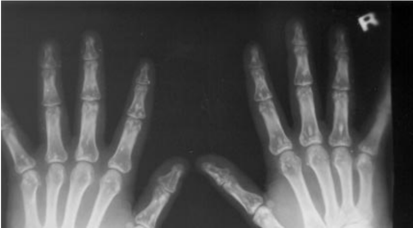
Figure 2. Osteopoikilotic lesions on hand roentgenogram of the patient.