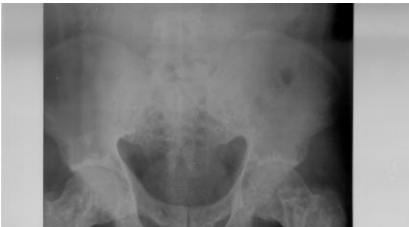
Figure 1. Osteopoikilotic lesions on lumbo-sacral roentgenogram of the patient

A 30-year-old man was seen in the orthopedic outpatient clinic with the complaint of low back pain. Numerous symmetric, small, well defined, circular sclerotic bone lesions were found on the X-rays of the lumbar spine and pelvis (Figure 1). Osteoblastic bone metastases were suspected and the patient underwent a detailed radiographic examination. The same lesions were also found in his hands and feet (Figure 2). He was then sent to the department of internal medicine for a detailed examination. Physical examination was normal. Laboratory examinations including biochemistry,