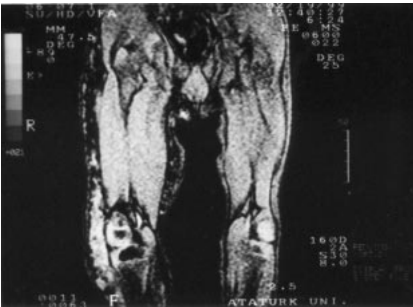
Figure 4. Varicose venous dilatations are well seen as bright signals on gradient-echo T2-weighted MR image.

Venography and arteriography is performed for treatment planning. Arterio-venous fistula associated with Parker-Weber syndrome can be detected by arteriography .