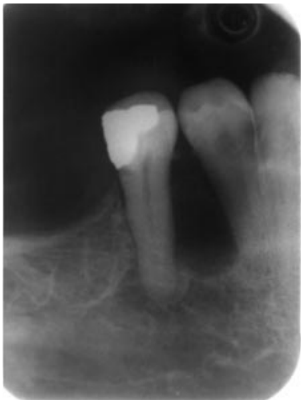
Figure 2. Radiographic appearance of the lesion.

reports separation of the epithelium from the connective tissue was present in our patient.