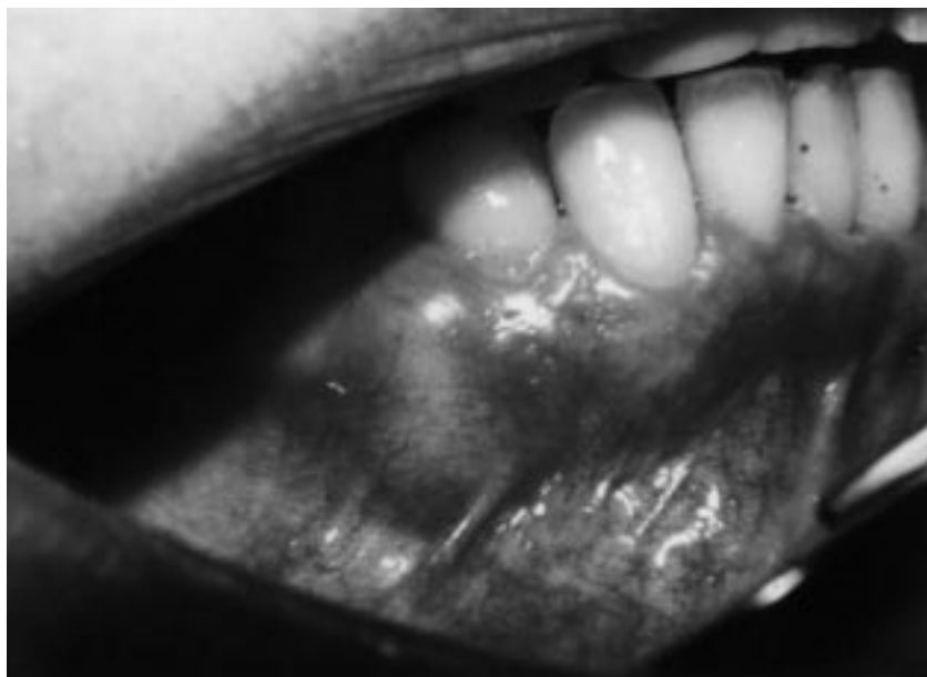
Figure 1. Clinical appearance of the lesion.

Other histological features of the lateral periodontal cyst include the absence of inflammation in the connective tissue, the artifactual separation of the lining epithelium from the underlying connective tissue, and the hyalinization of connective tissue immediately beneath the epithelium (2,3,4). Our case showed a typical epithelial appearance of lateral periodontal cyst, and the presence of mild chronic inflammation observed in the connective tissue is probably a result of secondary involvement from the neighboring inflamed gingiva. Angelopoulou et al. (5) also reported the presence of mild chronic inflammation in the connective tissue, but Cohen et al. (2) observed that the connective tissue in all cases was remarkably free of inflammation. Similar to previous