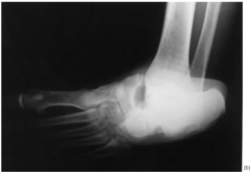
Figure 1. Radiographs showing the complete dislocation of a) talocalcaneal and b) talonavicular joints.