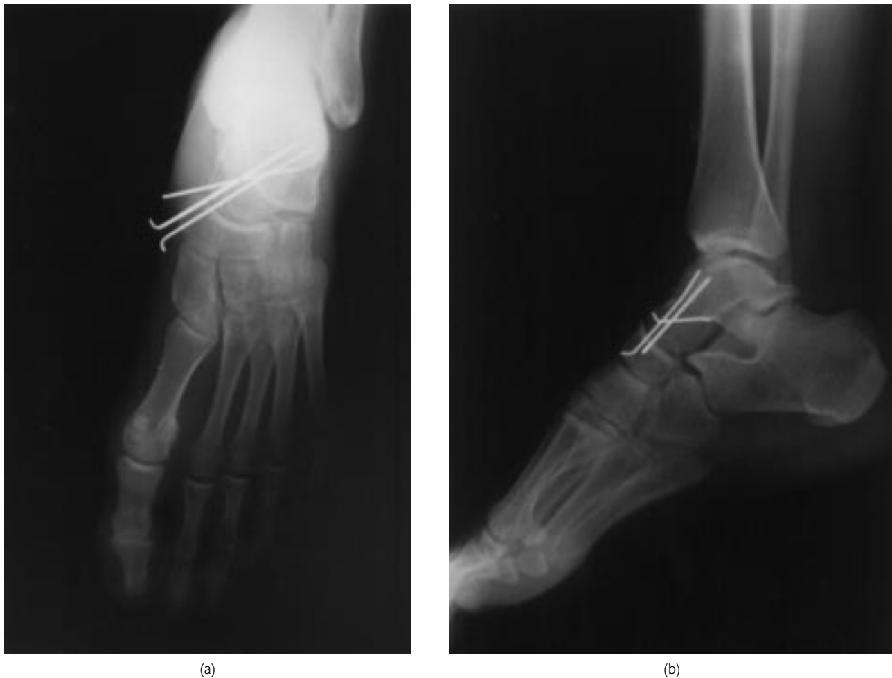
Figure 3. a) and b) radiographs after open reduction of peritalar dislocation and ORIF of the fracture of the head of the talus.

were removed without anesthesia, followed by physiotherapy and progressive weightbearing. At the end of the eighth week full weightbearing was permitted. The patient was monitored for 26 months. At the last follow-up examination he was currently pain-free in his daily activities, but he had mild to severe pain on the lateral side of the foot when walking long distances and at the forced inversion of the foot. There was no limitation of movement of the ankle joint, but the range of motion of the subtalar joint was diminished by 25% compared with the right side. There was no radiographic evidence of arthritis or avascular necrosis of the tarsal bones.