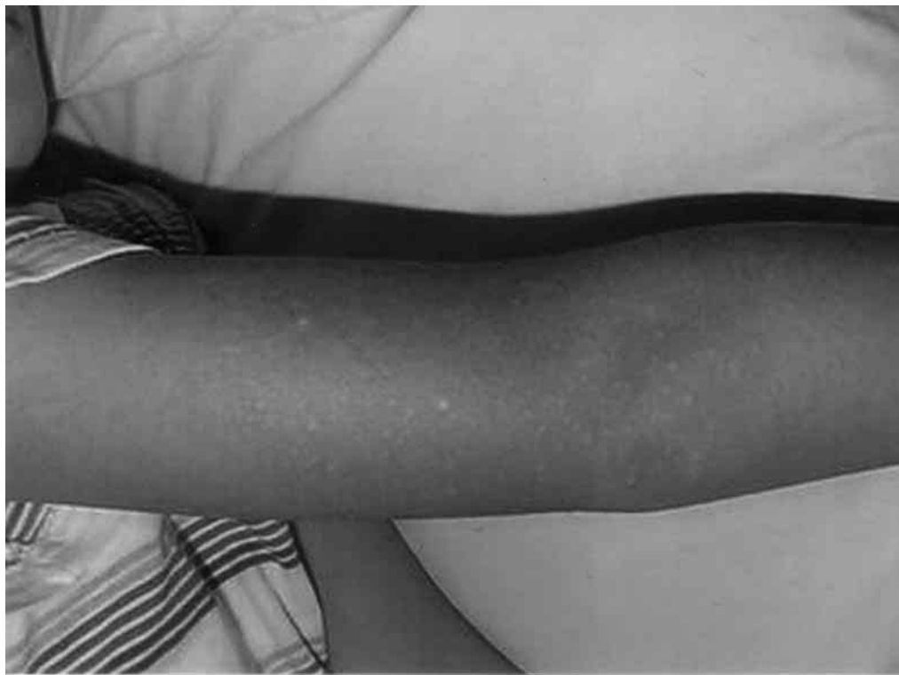
Figure 1. Gottron's papules.

34.1 mg/dl. Pulmonary function tests were normal. Occult blood in the stool was negative. ECG and echocardiography findings were normal.