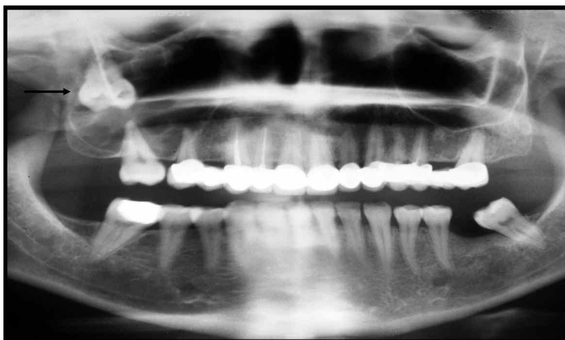
Figure 2. Pre-operative panoramic radiograph showing an osteolytic lesion in the right maxillary sinus. An ectopic third molar tooth is seen superiorly within the sinus.