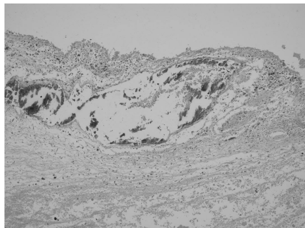
Figure 3. The ovarian cyst wall (HE \times 200).

complications are rupture of ovarian cysts with subsequent peritonitis and/or abscess formation (2).