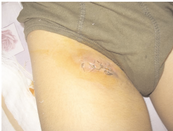
Figure 1. The patient seen after surgical removal of inguinal lymph nodes.

than 2.5 cm while the contralateral inguinal lymph nodes were normal. In abdominal ultrasonographic evaluation, there was no evidence of hepatosplenomegaly or of intra-abdominal lymphadenopathy. Chest radiograph was normal. Hemoglobin was 14.2 g/dl and white blood cell count 12 900/mm 3 with 44% neutrophils, 50% lymphocytes, and 6% monocytes. The erythrocyte sedimentation rate was 74 mm/1st hour and C-reactive protein was 46 mg/L (normal <5 mg/L). A tuberculin skin test (Mantoux) was positive with 22 mm diameter. Urine analysis and serum chemistry were normal. Antistreptolysin titer and serology for cytomegalovirus, Epstein-Barr virus, Toxoplasma, hepatitis B and C virus, and herpes virus were all negative. Lymph nodes were removed surgically (Figure 1). The patient underwent excision of lymph nodes; Ziehl-Neelsen stain revealed the presence of acid-fast bacilli and culture of the lymph nodes was negative. Histological sections showed the presence of extensive central caseous necrosis and multiple epithelioid cell granulomas (Figure 2). An extensive workup did not reveal any other foci of tuberculosis. Examination revealed no symptoms or signs of active tuberculosis in any members of his household. The patient was treated with a standard anti-tuberculous regimen consisting of isoniazid and rifampicin for nine months and pyrazinamide for the first two months. Two months after the initiation of treatment, the symptoms had resolved.