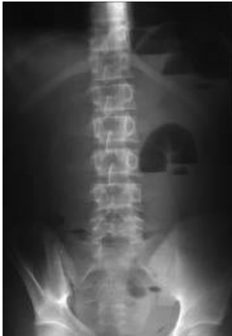
Figure 1. Plain abdominal X-ray shows small bowel obstruction.