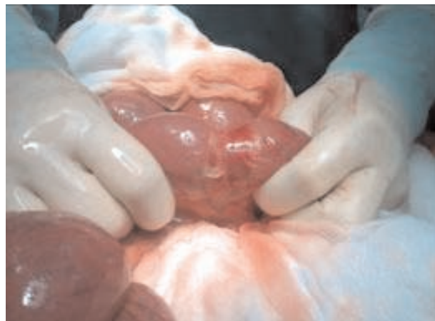
Figure 4. Obstructed intestinal segment with finding of compression.