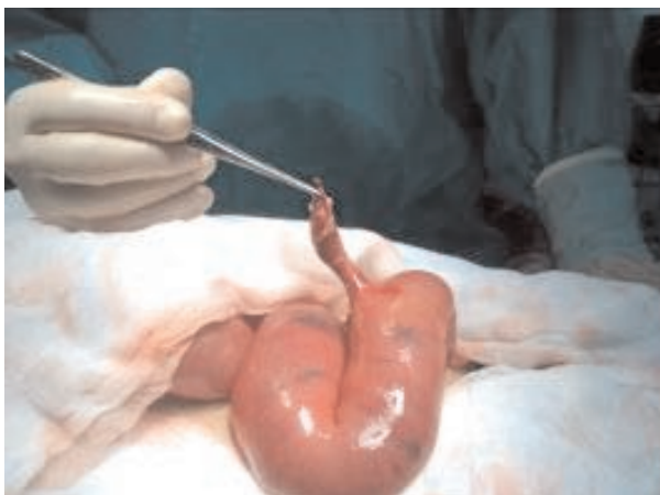
Figure 3. Inflamed Meckel's diverticulum after separation of adhesion from the anterior abdominal wall.

dilated and the terminal ileum and right colon were collapsed. The adhesive band was released, a diverticulectomy was performed; histological examination revealed glandular dysplastic enteric mucosa. The patient was discharged without complication 4 days after surgery.