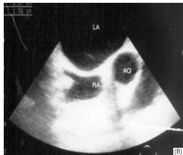
Figure 2. Transesophageal echocardiogram: (A) Interatrial septum showing an atrial septal aneurysm (ANE) bulging toward the right atrium (RA). (B) Inside the right atrium, there is a large, immobile, hyperechogenic thrombus attached to the atrial wall with a wide base (black arrow). LA: left atrium; AO: aorta.