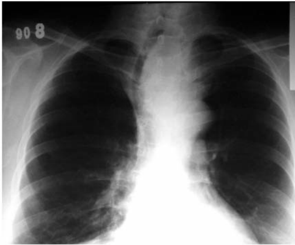
Figure 1. Posteroanterior chest radiography in a patient with tracheal deviation.