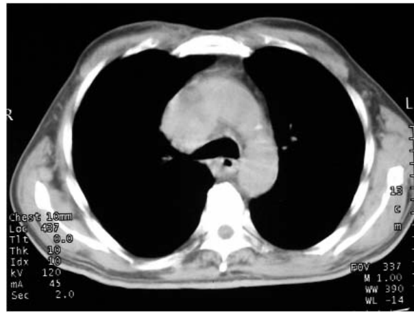
Figure 2. Computed tomography shows mediastinal extension of the gland.