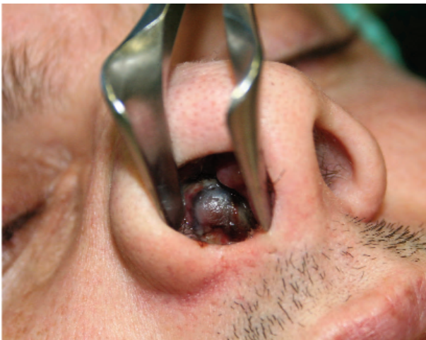
Figure 1. Giant lobular capillary hemangioma of the right nasal cavity.

Although LCH may appear in all ages, it is more common in the third decade and in females. The most common sites of mucosal LCH are the gingiva, lips, tongue, and buccal mucosa, but nasal cavity involvement is unusual, with the anterior portion of the septal mucosa and the tip of the turbinate as the most frequently involved areas in the nasal cavity (1,3). In our case, LCH was on the posterosuperior portion of the septal mucosa.