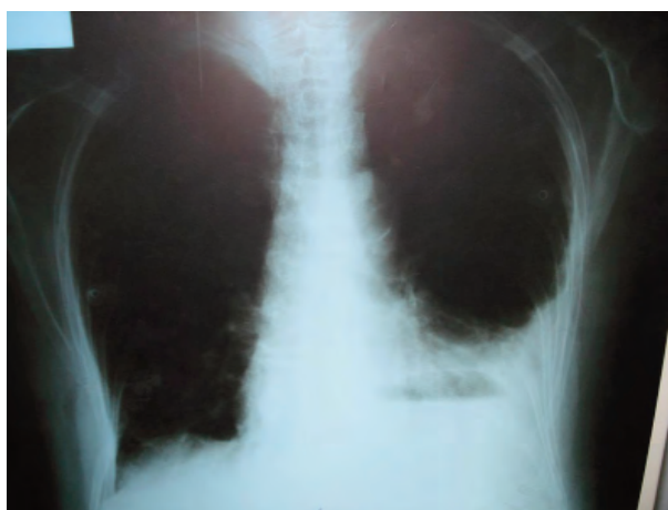
Figure 1. Chest x-ray of the first patient. Left hemidiaphragm eventration.

An eusophagogastroduodenoscopy was obtained. It revealed rotation in stomach, three large herniation pockets in fundus, major curvatura and antrum of the stomach, secondary to the volvulus. However, no bleeding focus was seen. She was operated, volvulus was corrected and paraesophageal hernia was repaired. Finally, she was discharged home healthy.