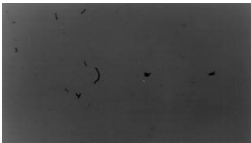
Figure 1. Avidin-Biotin staining of vaginal mucus for C. fetus subsp. venerealis (mag. x 1200).