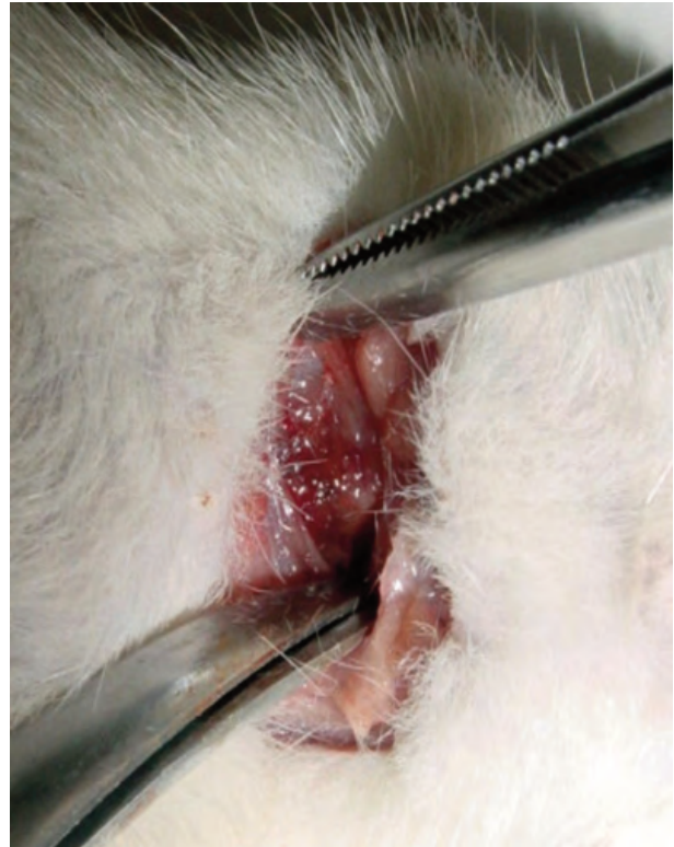
Figure 2. HA-CMC was completely absorbed from the surgical site on day 28.

months (17); thereby inflammatory activity and foreign body reaction may be delayed. One month may not be adequate for true determination of foreign body reaction for PLA.