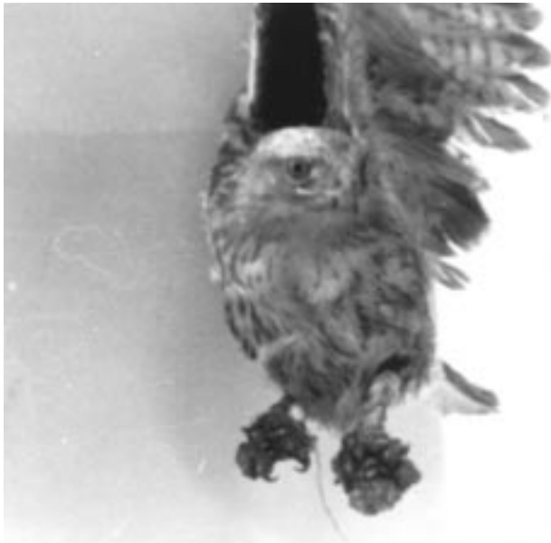
Figure 1. Avipox nodules on the toes, eyelid and beak.

The mortality from this disease is attributed to the bird's inability to capture prey because of the severity of its foot lesions and blood loss (7). At necropsy, the bird was observed to be in a very poor condition and there was no food in its gizzard. This was because of the inability to hunt, due to both the nodules on feet and the leg fracture.