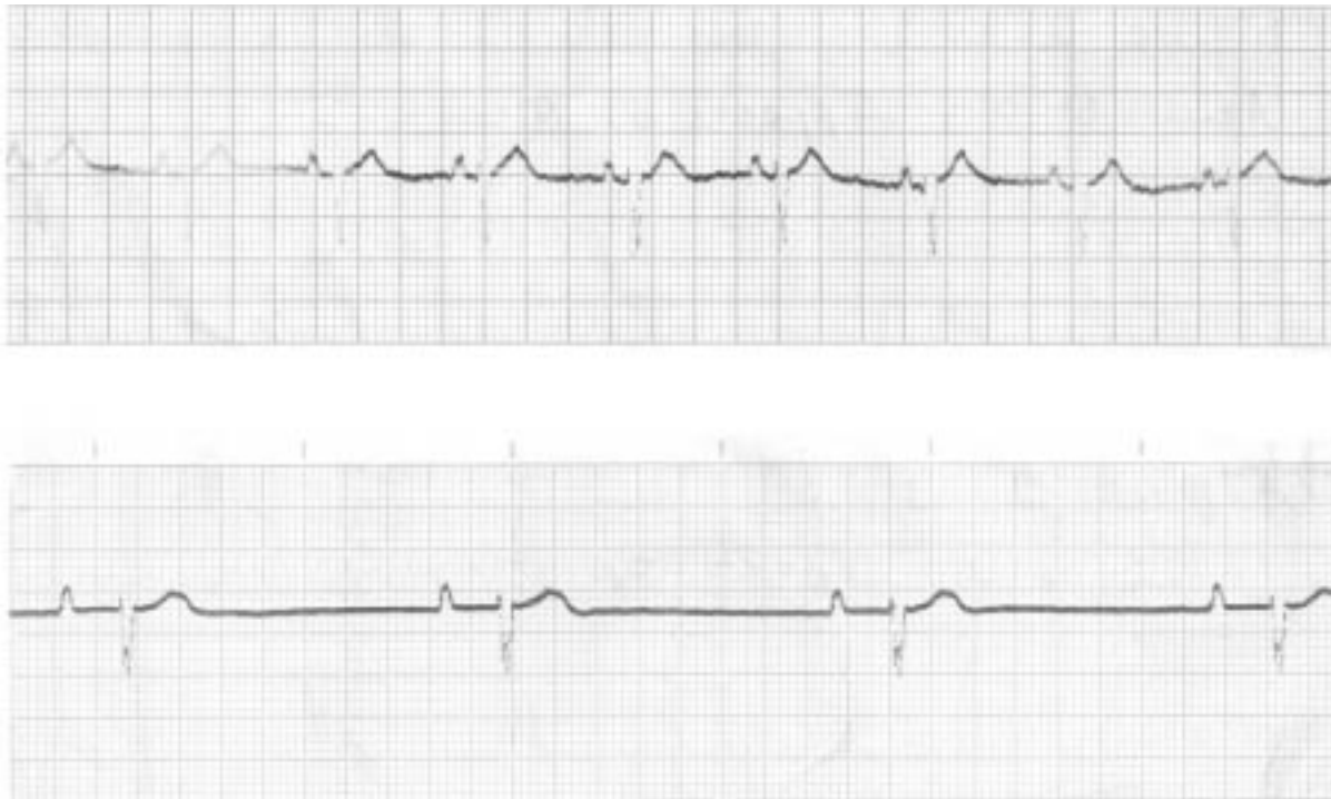
Figure 2. The electrocardiogram from a pigeon, a) control (0 min), b) sinus bradycardia (10 min after M, chart speed: 50 mm/s, standardisation: 1 mm = 10 mV).