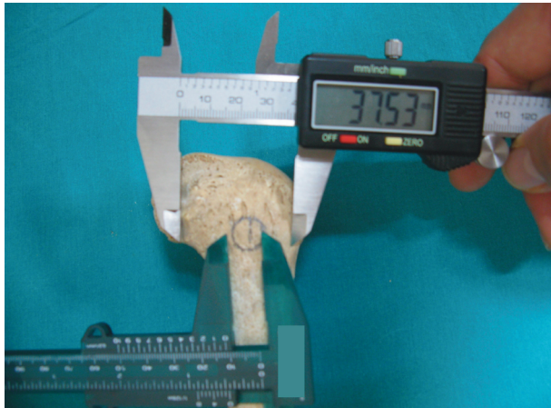
Figure 2. Distal lateral cortex width (DLCW = \alpha ) of the femur measured by an electronic vernier caliper at 1.5 cm proximal of the most prominent part of the lateral femoral epicondyle.

Moreover, our results demonstrated that while inserting a DCS-Plate, 38.04% of the mean width of the lateral cortex was lost (range: 30.43% to 46.09%) (Table 3).