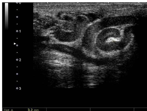
Figure 1. Varicose veins of the pampiniform plexus (arrows) in a 25-year-old male patient with ankylosing spondylitis.