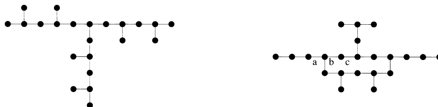
FIGURE 1. Intersection graphs.

coincide). Let \mathbb{C}\mathbb{C} be the union of six complex lines in \mathbb{C}\mathbb{P}^2 defined over \mathbb{R} so that their real parts intersect as it is shown on the left half of Figure 2.