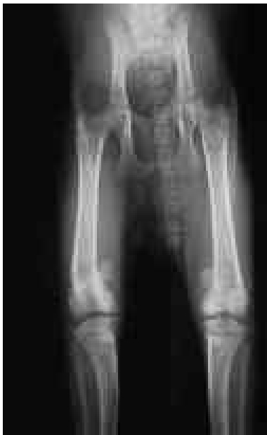
Figure 5. Case no. 7 (Pre-operative)