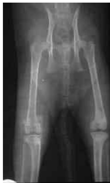
Figure 3. Case no. 4 (Pre-operative)