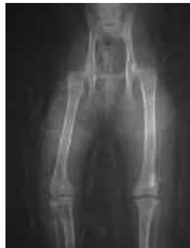
Figure 7. Case no. 7 (Post-operative-bilateral luxations)