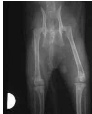
Figure 6. Case no. 7 (Post-operative right stifle joint)