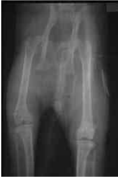
Figure 4. Case no. 4 (Post-operative)