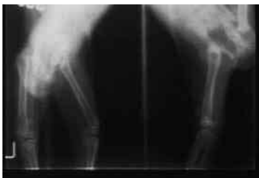
Figure 2. Case no. 5, 6 month follow up

in walking. Complete recovery was achieved in all of the cats treated surgically (cases no. 1, 2, 3, 4, 7 and 8). There were no post-operative complications in any of the cases (Figures 3-7).