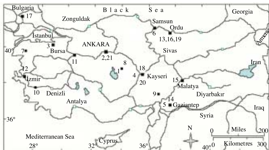
Figure 1. Sampling sites with denoted squares and sample numbers on the map of TURKEY.

A map of Turkey indicating the sample locations, sample numbers and important highways is given in Figure 1. Soil samples from 21 different locations in Turkey were collected in polyethylene bags. The samples were collected from the top 15-cm layer of the sampling sites at a distance of at least about 10 m from the highway with a stainless-steel spoon. Samples were immediately taken to the laboratory, and then stones and plant fragments were removed by passing the sample through a 2-mm sieve. Afterwards, the samples were dried at 105 °C in an oven; then the dried samples were crushed to a fine powder using an agate mortar and passed through a 200-mesh sieve. They were homogenised and stored in polyethylene bags until the analysis. Precautions were taken to avoid contamination during sampling, drying, grinding, sieving and storage. The particles less than 200 mesh (< 74 µm) in the soil samples, which are representative of true soil, were used for analysis. The soil samples were extracted as described below.