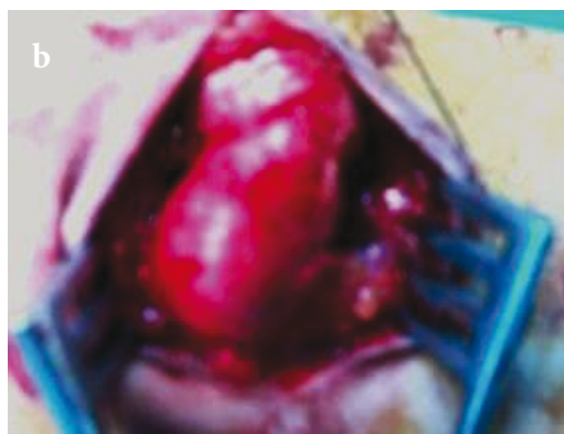
Figure 1. Polytetrafluoroethylene banding technique.