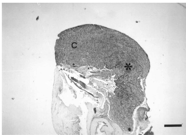
Figure 1. Cephalic and caudal zones of the pars distalis, cephalic (C), caudal zones (*), triple. Bar 350 μm.

FSH-ir cells were localized in both the cephalic and caudal zones of the pars distalis. However, they were distributed differently throughout the pars distalis of the 5 month-old laying hens (Figure 2). FSH positive labeling was observed in the cytoplasm of the gonadotrophic cells. FSH-ir cells stained brown with DAB chromogen had a small amount of cytoplasm, and spherical or ovoid and relatively euchromatic nuclei located at the center of the cells (Figure 3). The staining densities of the FSH-ir cells in the cephalic and caudal zones are shown in the Table. The average numbers of FSH-ir cells were similar in the cephalic and caudal zones. Additionally, the strongest positive reaction for FSH-ir cells was observed in both zones (Table). While limited number of weakly stained (+) FSH-ir cells were observed, moderately stained (++) FSH-ir cells had the same arithmetical average rate in both zones. FSH-ir cells of the pars distalis appeared to be arranged in either cords or follicles in which branching and anastomosing occurred, as well as being found as separate cells (Figure 4). Those cords and follicles had thin diameters and thus most cells were touching or close to the external surface of the cords. They were elongated in different shapes and were polarized towards the sinusoids of the pituitary gland.