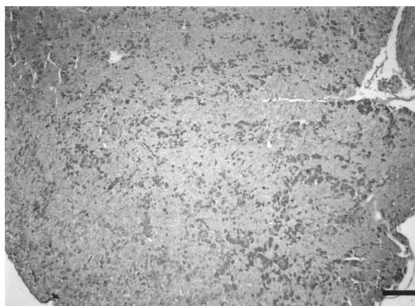
Figure 2. FSH-ir cells. Bar 140 μm.