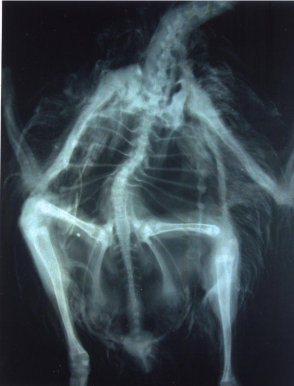
Figure 2. Appearance of the skeletal system on X ray.

antioxidant activity of the hepatic cells (6,25,26). In fact, there are reports that the increase in \text{CCl}_4 -induced hepatic injury caused by starvation results from the decrease in GSH content (27).