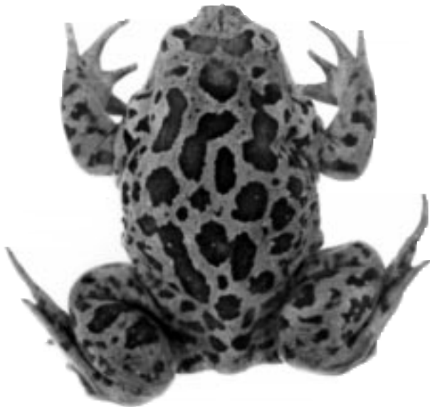
Figure 1. Dorsal view of a Pelobates syriacus .

The chromosome complement of Pelobates syriacus consists of 26 chromosomes. The seventh pair is acrocentric, the thirteenth pair is metacentric and the remaining pairs are submetacentric (Figures 2, 3a and b). The quantitative data measurements (relative lengths and arm ratios) are summarized in Table 1 for each chromosome. Based on the data in Table 1, we can divide the chromosomes into three groups: between the relative lengths of 13.68 and 10.11, there are 5 pairs; between 8.48 and 5.43, there are 3 pairs; and between 4.83 and 3.49, there are 5 pairs of chromosomes.