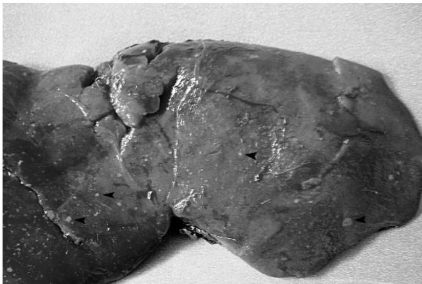
Figure 1. Numerous yellowish-white necrotic foci (arrows) of varying size in the liver of an aborted lamb.

Listeriosis is a sporadic disease of several animal species and humans, but it is most important economically in animals. Moreover, listeriosis is one of the most common causes of meningitis in humans and nonhuman primates (4). Listeric abortions are commonly caused by L. monocytogenes and occur in ruminants and many other species of domesticated animals. L. ivanovii is also recorded as a cause of abortion in sheep (2,3) and cattle (5,6), but occurs less frequently than L.