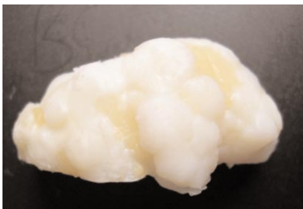
Figure 2. Macroscopic appearance of the tumoral mass.

over the course of 6 months. Swelling and lameness were observed at the clinical examination. Under general anesthesia, the tumoral mass was surgically removed via a lateral approach to the elbow joint.