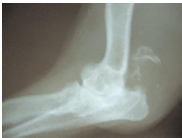
Figure 1. Radiographic view of the near olecranon and caudolateral side of the right distal humerus.

The terrier was brought to our clinic in the Department of Surgery, Faculty of Veterinary Medicine, Ankara University, with the complaint of right forelimb lameness. The tumoral mass had developed on the caudolateral side of the right distal humerus (Figure 1)