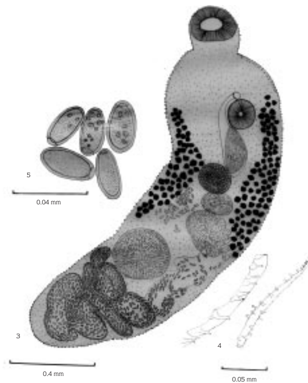
Astioglossimetra karachiensis n.gen., n.sp. Fig. 3. A paratype, entire specimen showing reproductive organs. Fig. 4. Body spines of anterior and posterior regions. Fig. 5. Eggs.