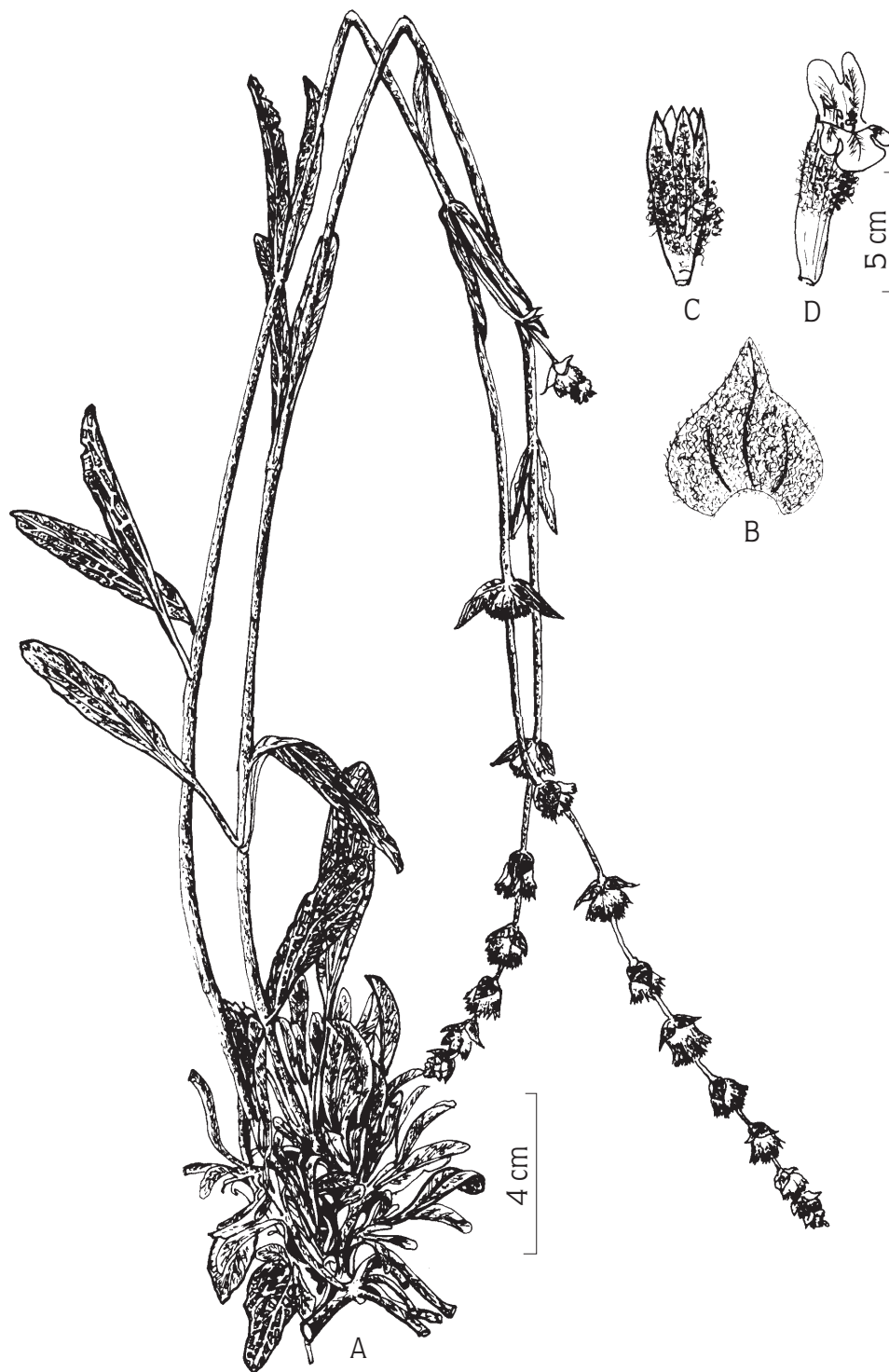
Figure 2. Sideritis vuralii : A-habit, B-bract, C-calyx, D-corolla