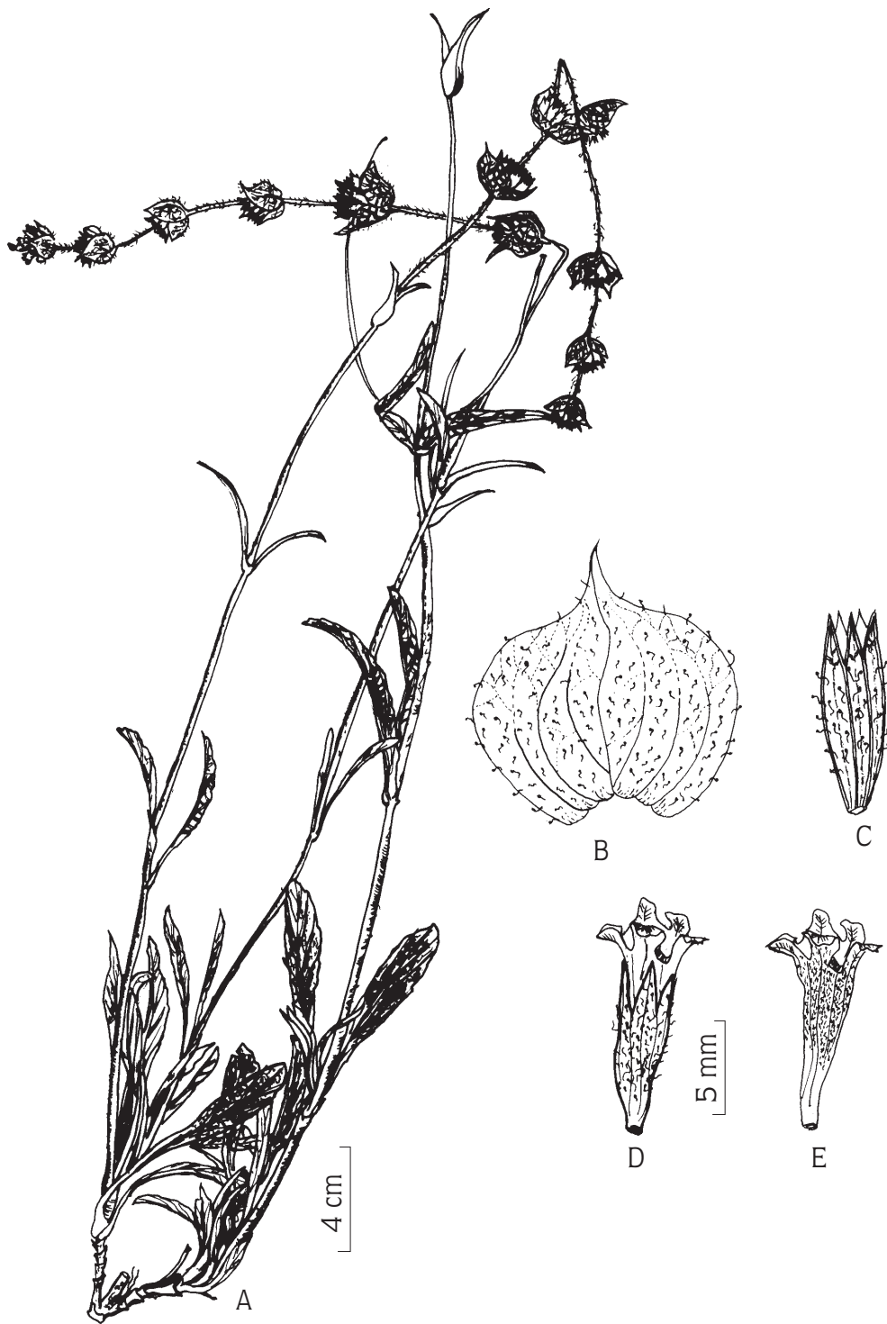
Figure 1. Sideritis caesarea : A-habit, B-bract, C-calyx, D-flower, E-corolla