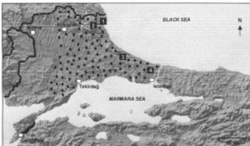
Figure 1. Collection localities in the European part of Turkey. 1: Kırklareli, İđneada; 2: Kırklareli, Demirköy; 3: İstanbul, Belgrad Forest and 4: İstanbul, Kemerburgaz. The dotted area shows the approximate distribution of Apodemus agrarius in the European part of Turkey.

Morphological Characteristics: Adult specimens of A. agrarius have upper parts that vary from yellowish brown to dark brown. A black line 1-2 cm in width stretches dorsally from just anterior to the ears to the base of the tail and is a defining character. The ventral side of the body is whitish smoky grey, but in young individuals the belly is blackish. There is a sharp demarcation line on flanks. The dorsal part of the tail is black and the ventral side is whitish with sparse hair, but these intergrade smoothly. The underside of the hind legs is black and bare