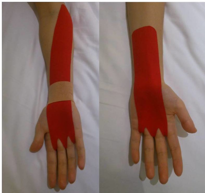
Figure 2. a) Kinesiotape application; b) Placebo kinesiotape application.

Kinesiotape was applied to both groups at the beginning of the week, to stay on for 5 days, with a 2-day rest, for a total of four times.