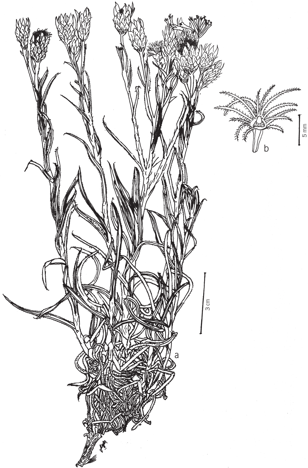
Figure 1. Jurinea stoechadifolia : a-habit , b-achene (Duman 5802 & Aytac).