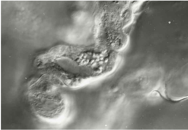
Figure 1. The spores of the microsporidian parasite in Malpighian tubule (1000x).