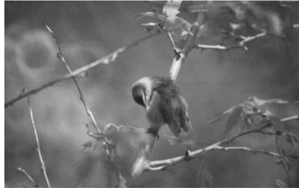
Figure 2. A view of the comfort posture of a male.

Krüper's Nuthatch is rarely seen on the ground, where it collects nest materials. Sitting and comfort postures are used by both sexes. It rests on the main branches of the tree with legs bent. The body feathers are fluffed and the wings spread out and feathers cleaned with the bill in the comfort posture (Figure 2).