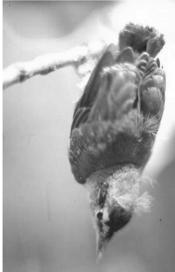
Figure 4. A juvenile as viewed in a hanging down posture.

An inviting call is used by parents when taking young birds that are flying for the first time to a refuge area densely populated with trees. A hanging down posture is used, especially by fledglings. The birds hang like bats on the thin branches waiting for their parents (Figure 4).