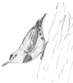
Figure 1. Upside-down posture.

Looking left-right is frequently observed in birds that have finished searching for food in cones or tree trunks. This behaviour indicates that the bird is looking for a new feeding area.