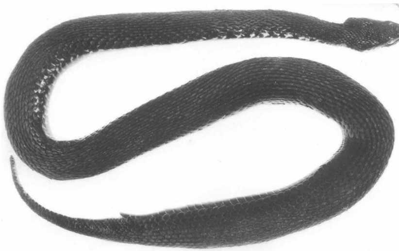
Figure 2. Adult female specimen of Vipera barani , from Geyve, Sakarya.

whitish spots were present below the head. Whitish spots at the edges of the ventral plates were sparse and continued to the end of body. The tip of the tail was yellowish-pink. This pattern observed in the juveniles was very similar to that of the female described from Ardeşen by Franzen and Hecks (2000).