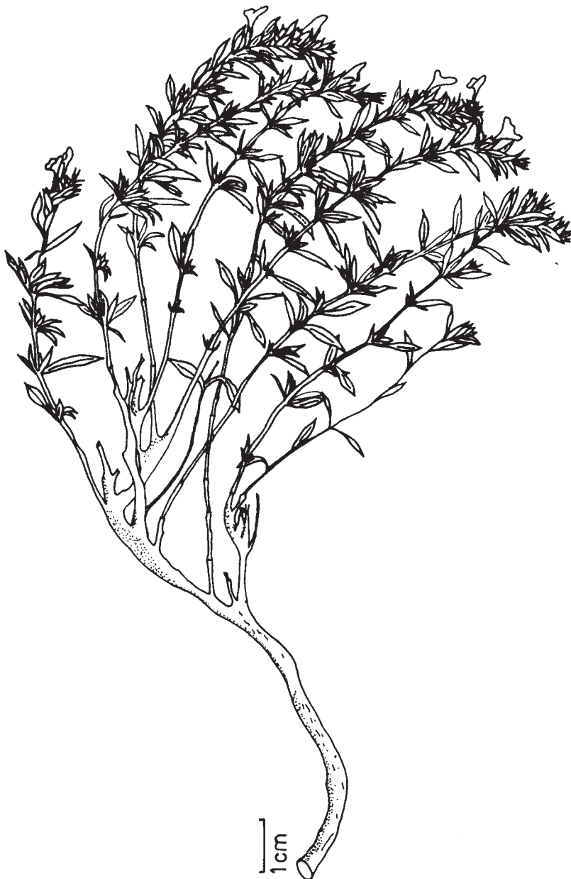
Figure 1. A. Plant. Satureja icarica P.H. Davis.

flowers subsessile. Bracteoles inconspicuous 0.5-2.4 (-3.25) mm, sessile, linear, densely pubescent, scabrid. Calyx (2-) 2.5-3 mm, campanulate, actinomorphic, sutural veins not prominent, glandular-punctate, hirsute, teeth lanceolate-subulate, slightly shorter than tube accrescent in fruit. Corolla white, with violet or purple markings on lower lip, bilabiate, 6-8 mm, densely white-tomentose outside, tube not exerted from calyx. Stamens included, anthers purple, filaments white (2-) 2.5-6 m. Nut oblong, obtuse, 2.0-2.2 x 1.2-1.4 mm, puberulent, dark brown (Figure 1).