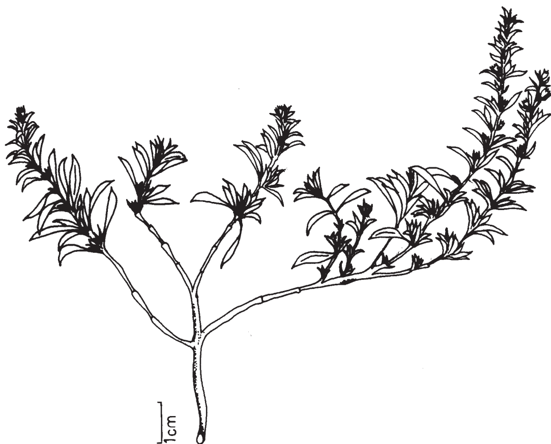
Figure 2. A. Plant. Satureja pilosa Velen.

According to P.H. Davis S. icarica is close to S. cuneifolia Ten. and S. montana L. var. hellenica Heldr. But it differs from S. cuneifolia Ten. by its cushion-forming habit and in possessing flowering stem less than 14 cm, cauline leaves 5.5-15 x 1.1-3.5 mm, usually sparsely hispid; calyx actinomorphic, sutural veins not prominent, corolla white with purple markings on lower lip, and from S. montana var. hellenica Heldr. in having unbranched stems, shorter inflorescence and slightly larger calyces (1).