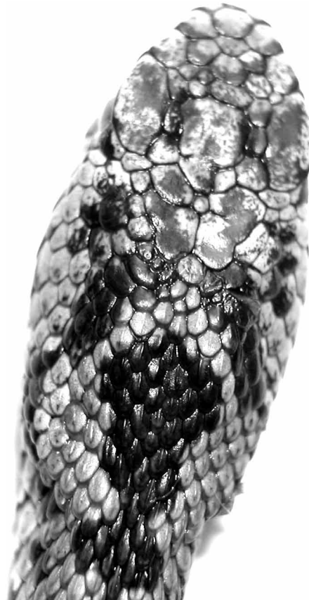
Figure 4. Dorsal view of the head of Vipera eriwanensis .

The number of intercanthals and intersupraoculars found 18 and shows a higher degree of fragmentation as in the eastern Vipera renardi (Höggren et al., 1993; Nilson et al., 1995). We observed one large frontal on the top of the head as in V. eriwanensis but the parietal was well fragmented and consisted of a small inter parietal plate, as in V. renardi (Figure 4). In contrast, V. eriwanensis has an unfragmented parietal (Nilson et al., 1999). It also differs from V. eriwanensis in having 3 equal plates, which separate the frontals from the supraoculars.