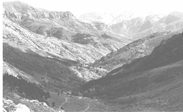
Figure 1. Habitat of V. eriwanensis , Gavur mountain, NE Turkey.

A male, total length 286 mm, tail length 43 mm, was collected on Gavur mountain (30° 10' N, 40° 22' S) situated in northeastern Turkey, province Gümüşhane, on 22 September 2003. This habitat, mostly at 2600 m altitude, was similar to areas inhabited by the Armenia and Kars eriwanensis and can be characterized as alpine steppe (Figure 1). In most places, it was sympatric with Coronella austrica and Rana macrocnemis . This specimen was preserved in the Department of Zoology at Karadeniz Technical University.