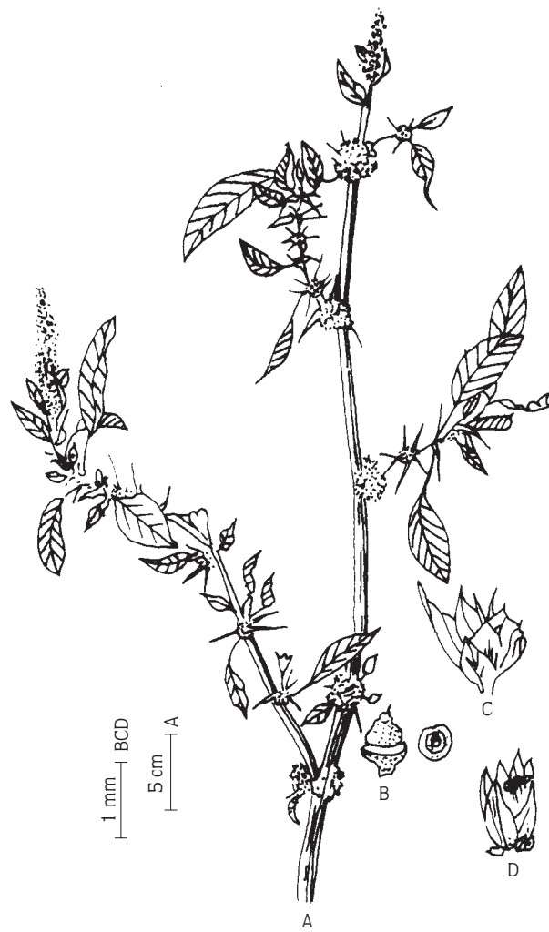
Figure 2. General view of A. spinosus . A) Habitus B) Seed and fruit C) Female flower D) Male flower